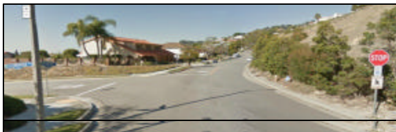
Streets & Landscaping by Don Ott

1. In Progress: Trim bushes/clean up area on PVDr E, south of Ganado. This task should be completed within the next few weeks. 2. MHOA requests for help from those residents on Ganado near Floweridge. Occasional watering of the Oleander bushes would be very helpful since we don't have any legitimate way to water them any more. 3. Note: The sick trees at Floweridge and Ganado are the result of gophers. Anybody have a gopher recipe? 4. Bennett Landscaping will be giving us a bid on plants and pruning at the entrance. 5. IMPORTANT. There's been recent talk at the Board of Directors level about whether or not to enhance the Ganado entry signage shown in the top picture to make it more showy. Since you have to look at it too, we'd like your opinions and ideas on the subject. Send an email to me (Don Ott) and I'll bring it to the Board for review.